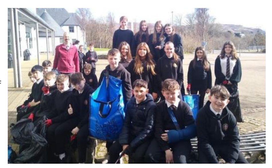
As part of Tutor Time, our S1 classes focussed on Article 24 of the UNCRC- Health, Food, Water and Environment. 1T were doing a litter and recycling pick-up in the school and local community. 4Rs – Responsible.